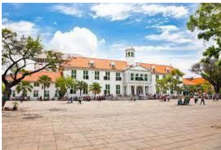
Figure 3. Jakarta Old Town Icon

Profile and History of the Old City DKI Jakarta is the capital city of the Republic of Indonesia. Since independence in 1945, Jakarta has been an icon for historical heritage from the Dutch colonial era, currently known as the Old City of Jakarta. The position of the Old City of Jakarta occupies a very strategic location. Visiting is easy, so the kingdom often fought over control of its territory in ancient times. The Old City of Jakarta is located between 2 municipalities, West Jakarta and North Jakarta, in the Pinangsia village, Tamansari sub-district. The Old City of Jakarta is also called Oud Batavia or Old Batavia. This area was previously known as Batavia, which has now changed to Kota Tua Jakarta. The very strategic location meant that the Old City was fought over in the past by several kingdoms, such as the Tarumanegara Kingdom, the Padjadjaran Kingdom, the Sultanate of Banten, the VOC, and even Japanese allies also fought over the Old City of Jakarta.