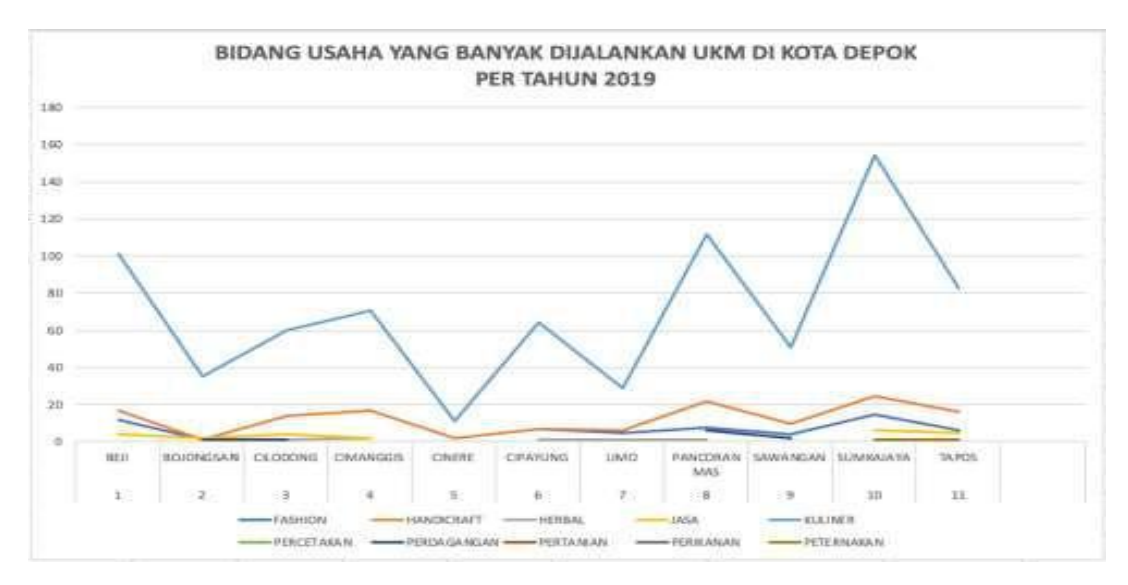
Fig. 1. The Business Fields that are mostly run by SMEs in Depok City in 2019

The results in the field show that from the many discourses that have emerged regarding support for the development of SMEs, most of the interested parties are more focused on improving financial access for SMEs. And it can be said that there are still few who provide support for innovation, let alone sharing knowledge about how to innovate. Wherever there is, innovation is only understood as an effort to replicate existing business products, not as the ability to create business novelties to increase the growth and competitiveness of SMEs in the global market. So it is not surprising that the business diversification carried out by SMEs is not optimal.Majalah Ilmiah Bijak Vol 1, No. 1, Maret 2018, pp. xx-xx