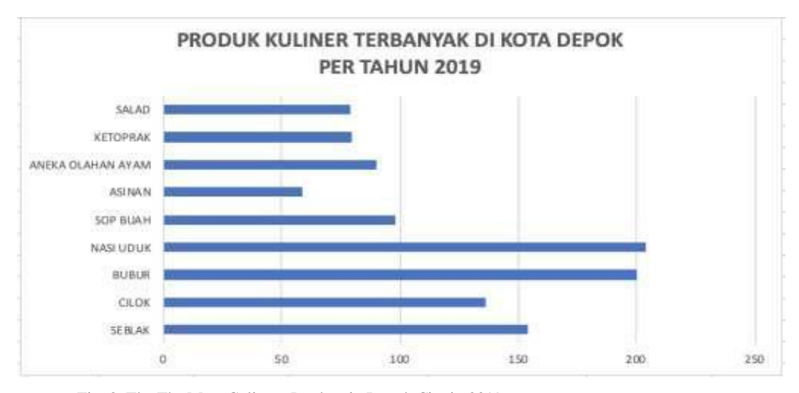
Fig. 2. The The Most Culinary Product in Depok City in 2019 Source: Research Result, 2019

The data above shows that in 11 Districts in Depok City, it turns out that the business fields run by SMEs are mostly in the culinary sector. Business fields other than culinary are not very active and the numbers are small. The culinary sector tends to be popular considering the population in Depok City is quite dense, so business people are interested in pursuing the culinary business even though its existence has experienced ups and downs.