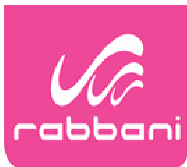
Figure 1. Rabbani Symbol

Imron verse: 79 which means in the servant of Allah SWT, who is willing to teach and be taught the book of Allah SWT.