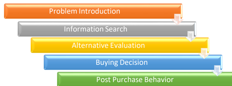
Figure 2: The Purchasing Process

The purchasing decision process, through a process called five-stage model, namely:(Kotler, 2017: 184)