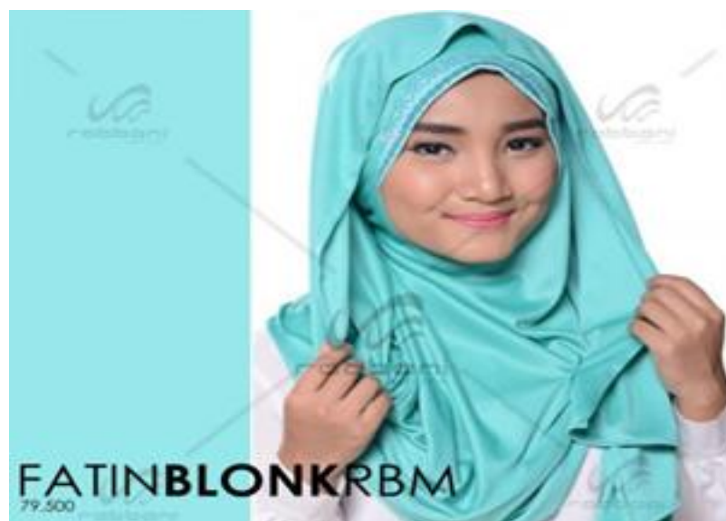
Figure 3. Brand Ambassador Rabbani