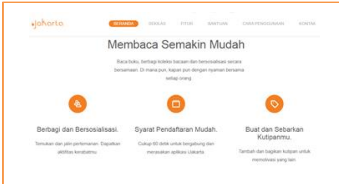
Figure 3. ease of registering

Based on the results of in-depth interviews, it can be analyzed that from the empathy dimension, the quality of digital library services in the DKI Jakarta Library and Archives Service is not very good. This justification is based on 2 things: 1) Handling of complaints is still very dependent on PT. Aksaramaya. This can prevent users who need to handle complaints quickly because Dispusip must coordinate first to PT. Aksaramaya; 2) There is no audio book facility that should be available for persons with disabilities from the blind group.